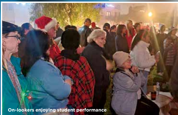
On-lookers enjoying student performance